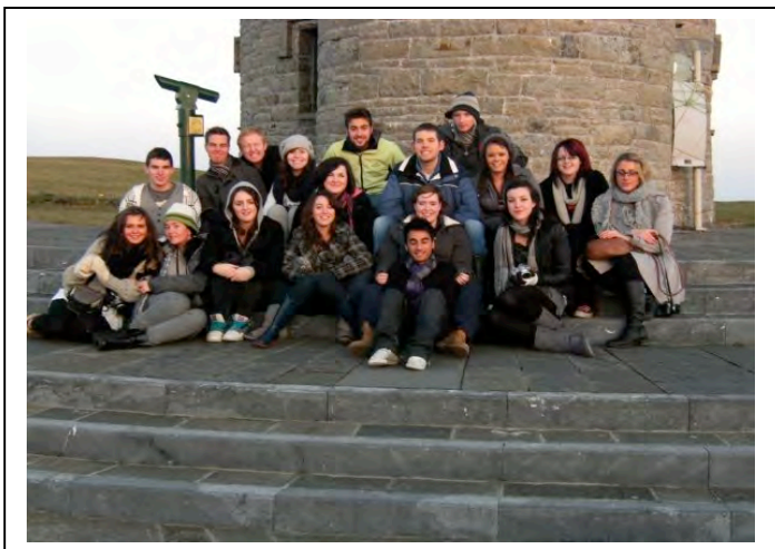
Above: Some of the students who travelled