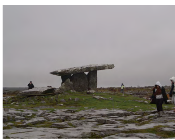
Above: A Dolmen found in the Burren